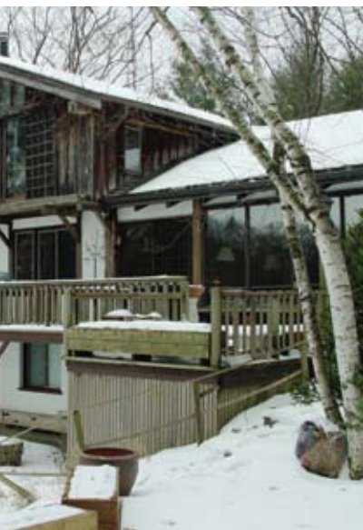
The Schreyers' house with Studio Brigitte on the lower level