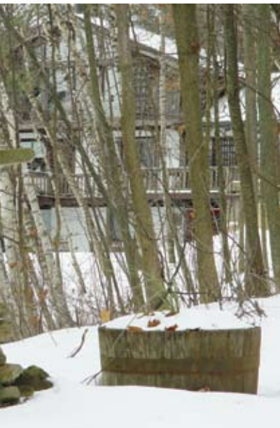
From the driveway to Studio Brigitte