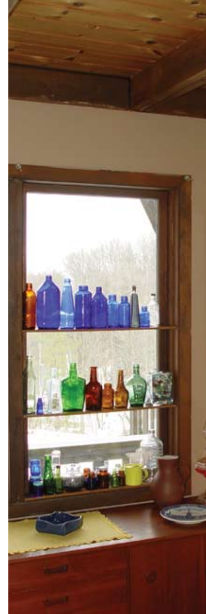
Colourful glass and a favourite painting

On the opposite wall is what must be the most expensive original sketch in the world by Robert Bateman, the renowned nature art-