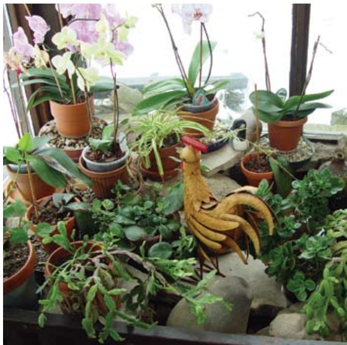
The indoor garden in the dining room

After showing the many canvases downstairs, Schreyer leads the way upstairs. The house makes a big impact with its open spaces framed by dark wood, with large picture windows showing forest and lawn rolling down to trees. In the distance, on the horizon, is the distinctive shape of the Niagara Escarpment's Rattlesnake Point.