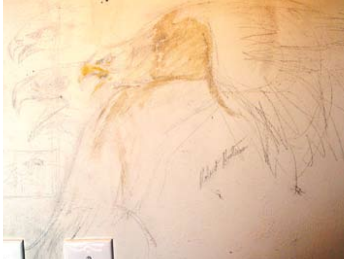
Bateman's eagle sketch on the wall