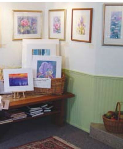
Schreyer's works on display